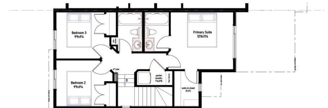
UNIT SQFT - UPPER 630sq ft