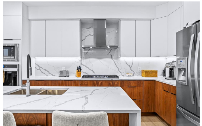
THE CHEF-INSPIRED KITCHEN IS AN ABSOLUTE SHOWSTOPPER