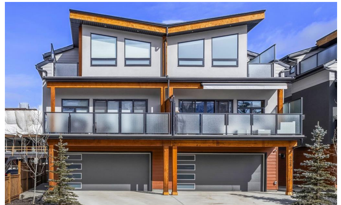
WELCOME TO UNIT 1 AT 826 7TH STREET IN CANMORE ALBERTA

With four spacious bedrooms and four luxurious bathrooms, this home is designed for comfort and convenience. Three of the bedrooms feature their own ensuites, ensuring privacy and luxury for each resident or guest. Whether you're waking up to a mountain