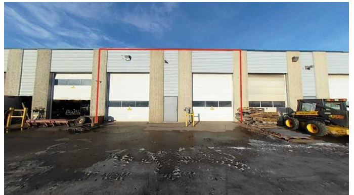
7491 49 Avenue

Washrooms Radiant Heaters Upstairs Mezzanine