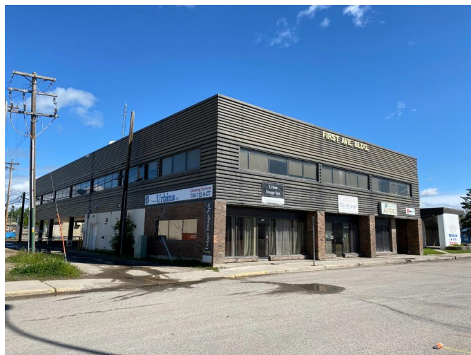
4926 1 Avenue, Edson, AB

Upstairs Total Exterior Area 10294.32 sq ft Total Interior Area 9995.42 sq ft