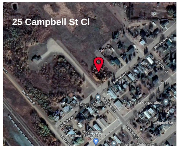
25 Campbell St Cl